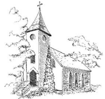
St. Mary of the Rosary, Hepworth Sunday 9:00 am (Nov-Mar)